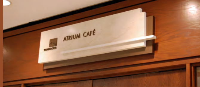
Project: The Terraces, Dunwoody, GA