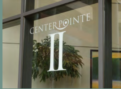
Project: Center Pointe, Sandy Springs, GA