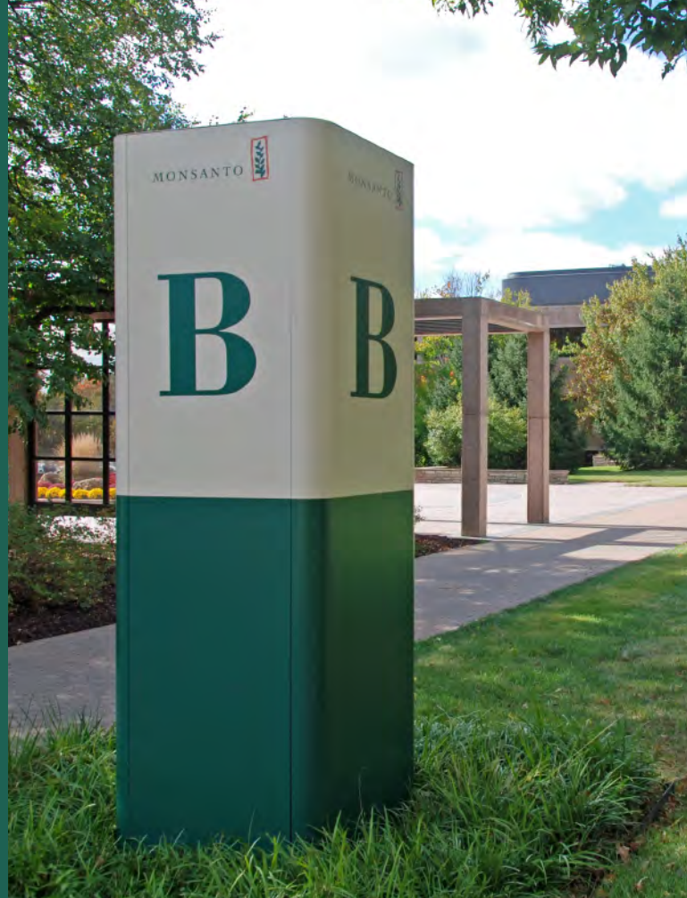
Project: Monsanto, St. Louis, Missouri