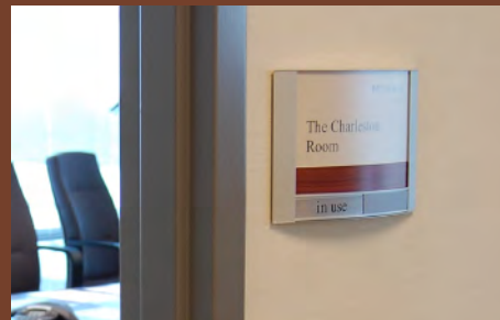
Project: McNair Attorneys, Columbia, SC

APCO offers a wide range of innovative interior sign systems, all manufactured at our Atlanta headquarters using the latest technologies. APCO's interior systems have received 7 awards for design excellence from the Industrial Designers Society of America and have been proven over time in corporate facilities throughout the US. Combining the best of both form and function, APCO products are 100% updatable to accommodate changes yet offer unique design features and finishes for a customized look compatible with any interior environment.