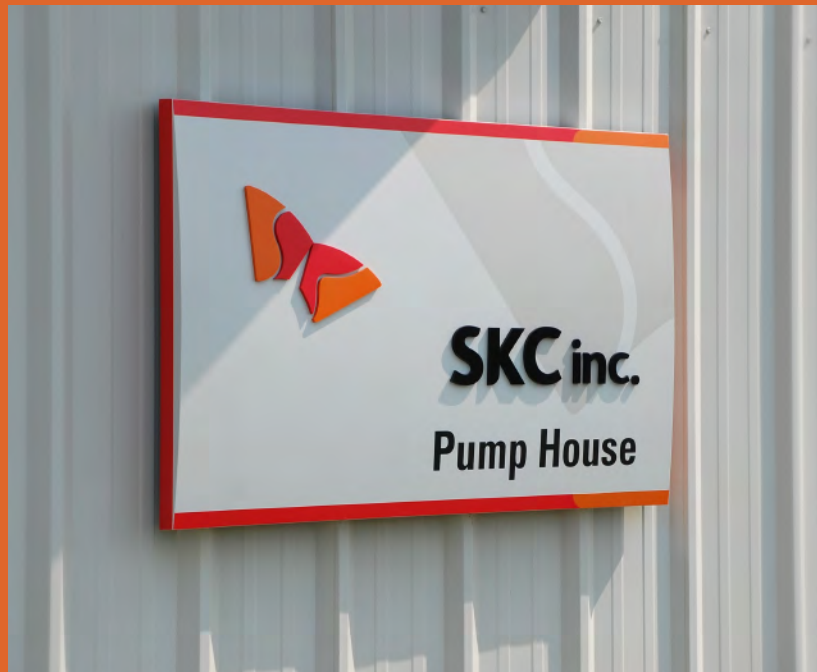
Project: SKC, Inc., Covington, GA