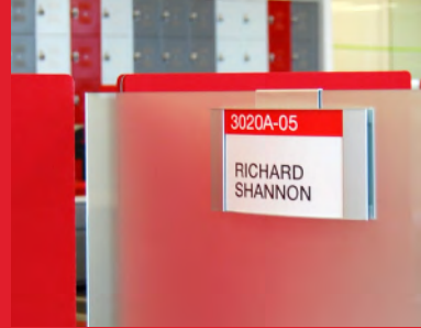
Project: Coca-Cola, Atlanta, GA