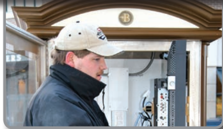
Top: Digital sign behind the Bayshore customer service desk. Middle: One of many outdoor kiosks at Bayshore. Bottom: An AlivePromo technician performing routine maintenance.